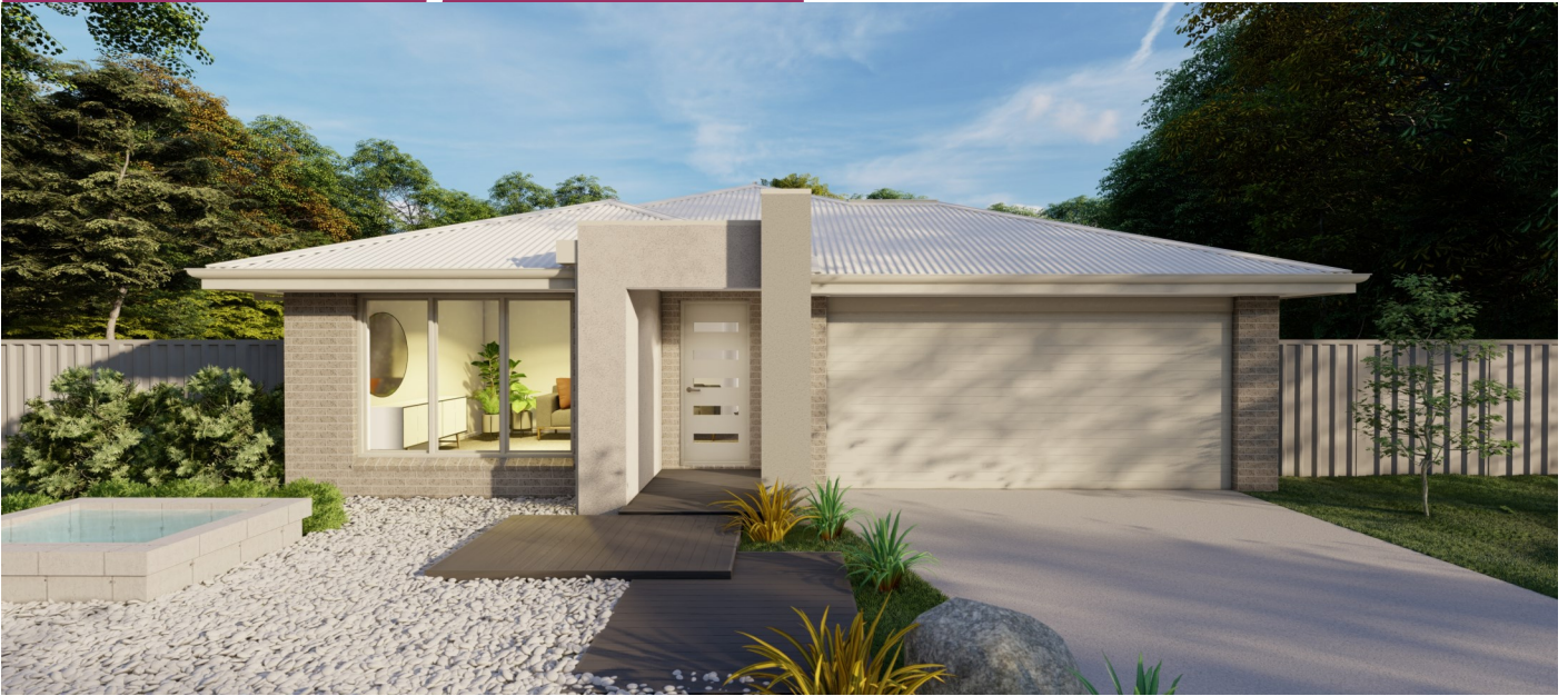
Image & façade shown for illustrative purposes