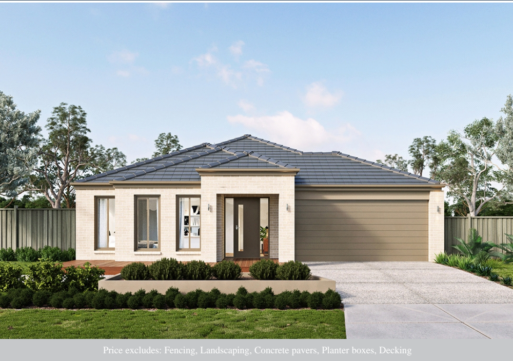
Price excludes: Fencing, Landscaping, Concrete pavers, Planter boxes, Decking